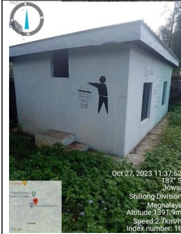
Oct 27, 2023 11:37:52 187° S Jowai Shillong Division Meghalaya Altitude:1391.9m Speed:2.7km/h Index number: 16