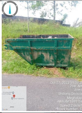
Oct 27, 2023 11:37:38 294° NW Jowai Shillong Division Meghalaya Altitude:1392.2m Speed:2.6km/h Index number: 14