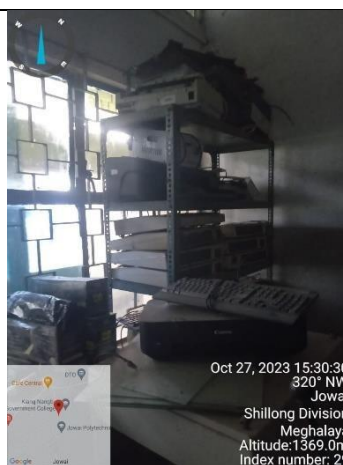
Oct 27, 2023 15:30:30 320° NW Jowai Shillong Division Meghalaya Altitude:1369.0m Index number: 29