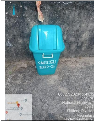
Oct 27, 2023 11:41:12 23° NE National Highway 6 Jowai Shillong Division Meghalaya Index number: 20