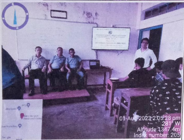
01-Aug-2023 2:05:28 pm 281° W Altitude:1347.4m Index number: 205