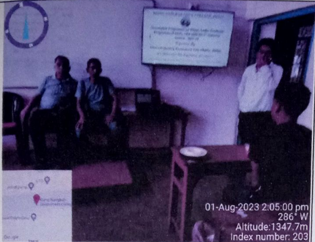
01-Aug-2023 2:05:00 pm 286° W Altitude:1347.7m Index number: 203