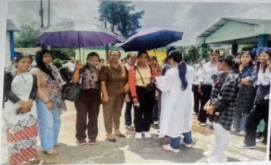
Students along with Teachers