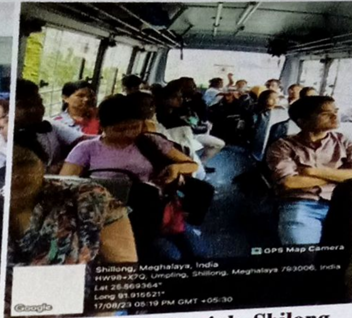
Leaving ITI, Rynjah, Shilong